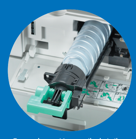
Toner replacement is a snap thanks to the 8016/8020/8020d's dual component design.